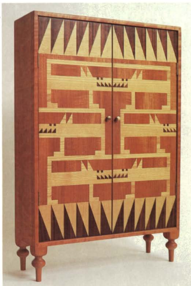
Marquetry cabinet was built to hold a client's Indian jewelry.