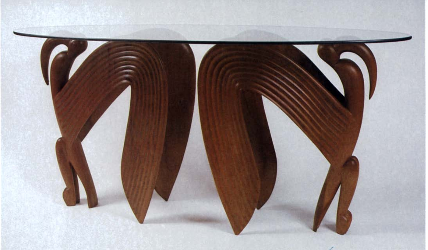
For a sturdy table, McKie took pains to include long-grain lines running straight from the top to the floor. A thicker-than-usual oval glass top visually counterbalances the massive carvings.