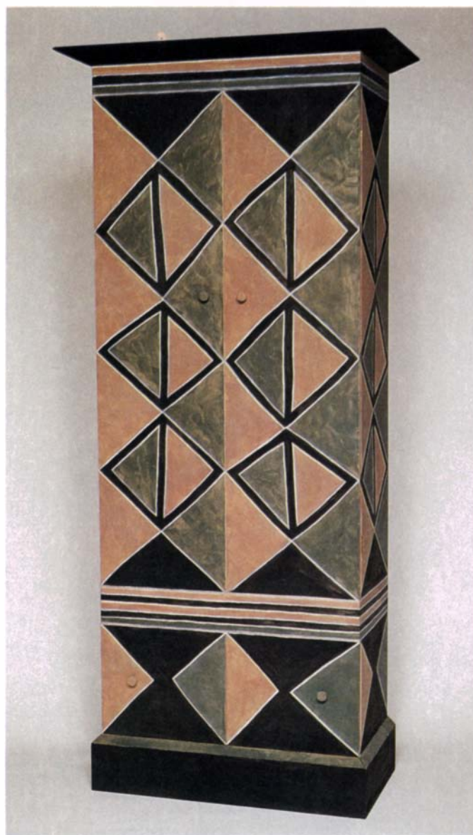
Shaker-inspired cabinet is decorated with milk paint.

My designs have always gone through a lot of drawings