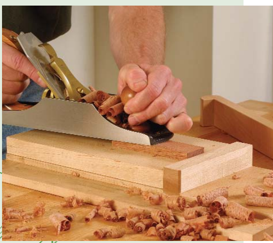
An auxiliary deck raises thin stock. A solid-maple shim reduces the height of the stop block to accommodate thin stock.