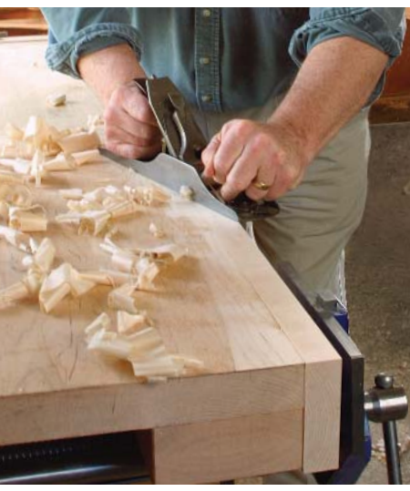
Plane the top edge of the face. A sharp handplane is all it takes to get the face flush with the top of the bench.

board remains in contact with the back face the full length of the bench. That makes it easier to clamp the end of the board to the benchtop.