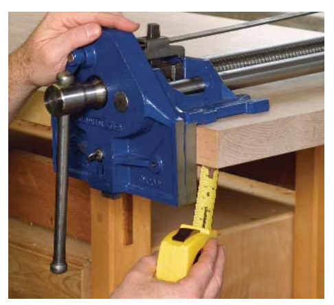
Figure out the filler-block thickness. With both the vise and benchtop upside down to make the job easier, measure the distance from the benchtop to the top edge of the vise jaws and then add ½ in. to ¾ in.