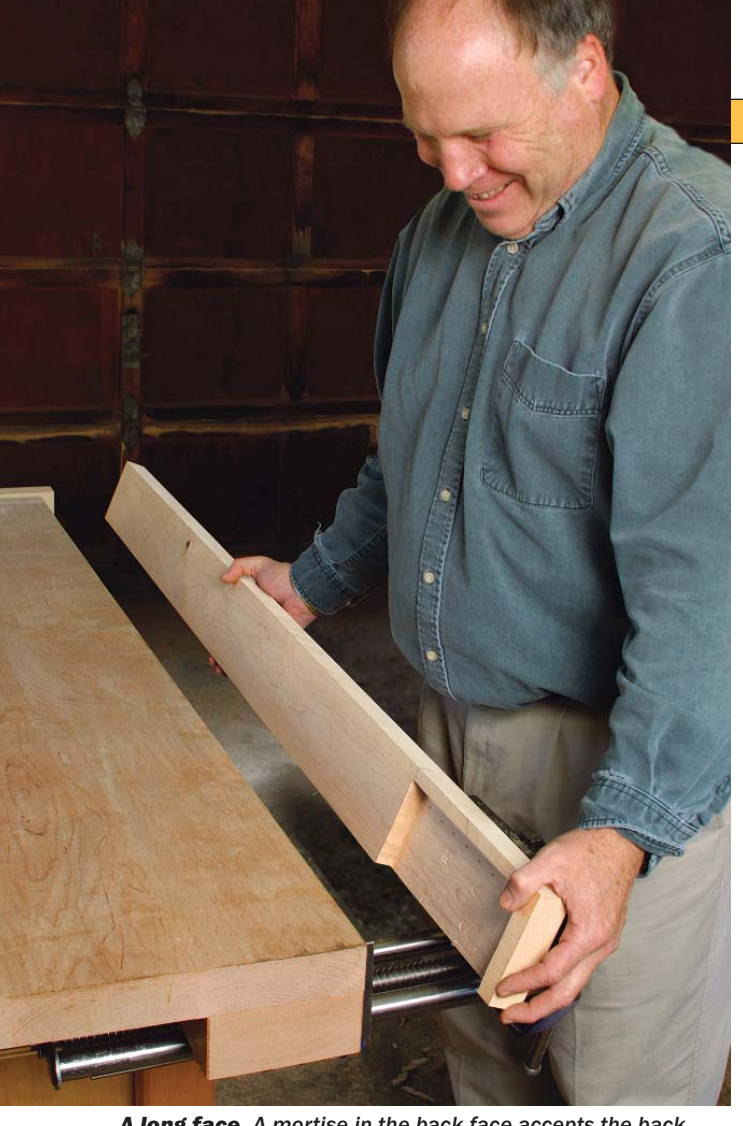
A long face. A mortise in the back face accepts the back jaw. The face extends the full length of the benchtop, which will make it easier to clamp long boards.

benches include both front and end vises. If a bench is limited to having just one vise, it's best to install it as a front vise, because most of us naturally gravitate toward the front of the bench.