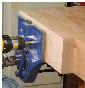
Add the front face. Like the back jaw of the vise, the front jaw is tapered. To minimize the effect of the taper, you can bevel the outside surface of the front face slightly. Then attach the face by driving two screws through predrilled holes in the jaw.