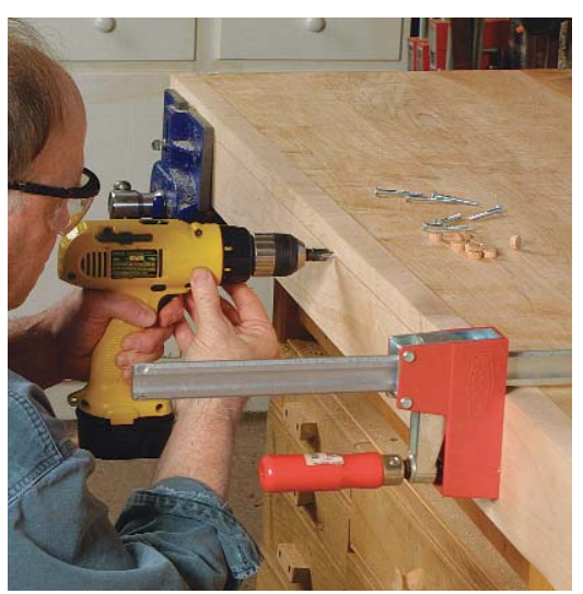
Attach the back face to the edge of the benchtop. To fill in the gap between the back face and the back jaw of the vise, add a couple of strips of epoxy putty to the mortise just before applying the face to the bench (left). After coating the jaw with paste wax, attach the face with a few wood screws driven into counterbored holes (right).