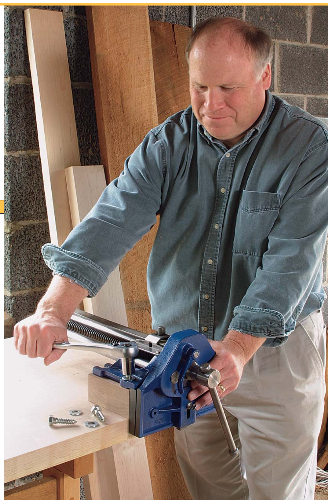
Attach the filler block, then the vise, using lag screws. You might think that about does it, but to get the most out of the vise, you should cover the metal jaws and edge of the table next.