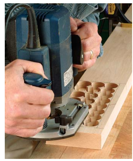
Measure, mark and cut out the mortise. On many vises, the face of the back jaw isn't square to the benchtop. To make sure the mortise ends up deep enough, measure the depth from the thickest part of the jaw. Use a drill bit to remove most of the waste stock before using a router to clean out the waste that remains.

benchtop's design. The procedure outlined here covers the most common installation, one where the back jaw of the vise simply butts against the edge of a top that's about 1½ in. thick.