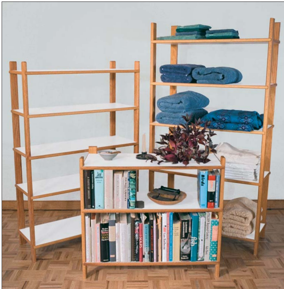
A versatile design for a variety of uses. These shelves can be sized to fit any location.

As unassuming as these shelves are, they have many of the features that I like most in furniture. They're lightweight, sturdy and use simple, effective joinery. The design I use evolved partly from childhood memories of shelves in our house and partly from the built-in storage-shelf system that I now install in houses. Plastic laminate glued to both sides of medium-density fiberboard (MDF) or particleboard makes the shelving stiff. Tight-fitting dado joints and front and rear uprights at right angles to each other make the assembly strong and resistant to racking.