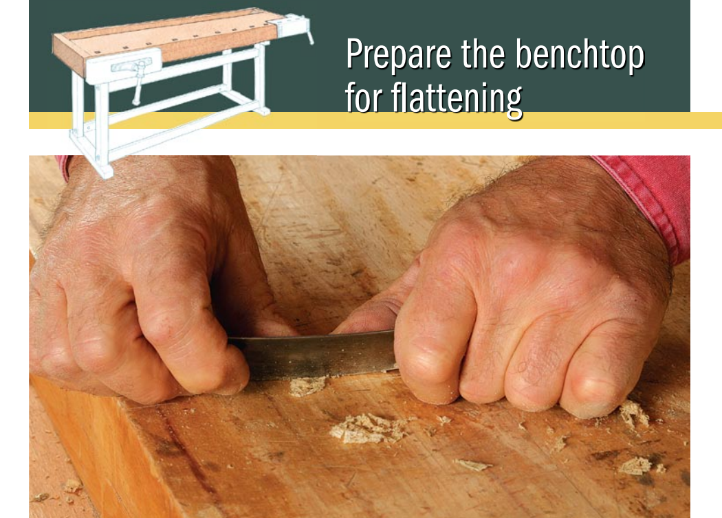
Smooth the bumps. Use a scraper to remove any dried glue or finish from the benchtop.

Early in my career, I used a belt sander to flatten my bench, but it only made matters worse. Handplaning is the way to go. You'll need a well-tuned No. 5, No. 6, or No. 7 plane, depending on the size of the workbench (see top right photo, p. 44). A high-quality plane from Lie-Nielsen or Veritas is a major investment, but you can buy a new Stanley or Anant for $60 to $90. It is also possible to find used planes on eBay or at flea markets, or you can borrow one from a fellow woodworker. (For tips on how to