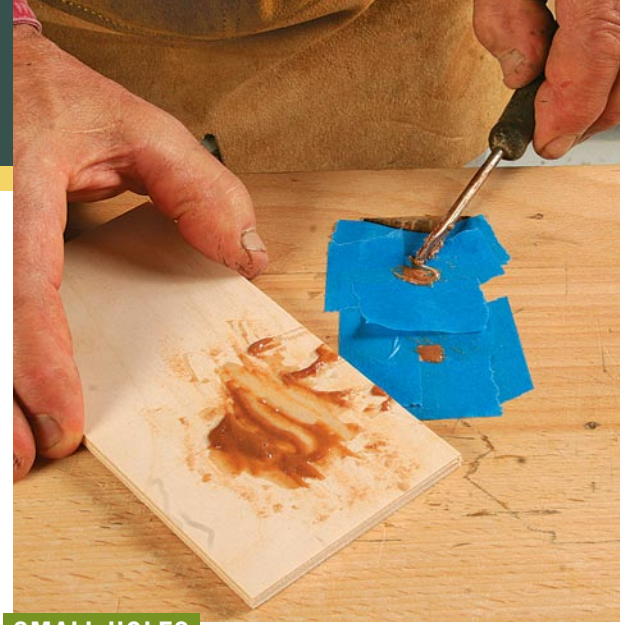
SMALL HOLES Epoxy does it. Medium-size holes can be filled with a mixture of very fine sawdust and epoxy. Frame each hole with masking tape.