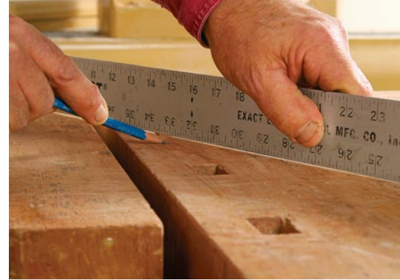
Flag the high spots. Move the edge of a 4-ft. ruler across the benchtop and use a pencil to mark the high areas.