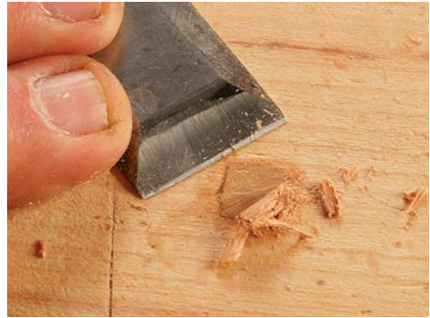
LARGE HOLES Square pegs in round holes. After cleaning up small holes with a Forstner bit, cut a peg slightly larger than the hole. Taper two opposite sides of the peg, round its corners (left), and tap it into the hole (center). When the glue has dried, trim the plug flush (right).

mer, or chisel to remove the wood from the benchtop within the scribe lines. A pressure fit with no gaps around the edges is your goal. To make it easier to fit the Dutchman, it helps to chamfer its leading edges lightly. After gluing the Dutchman in place, use a plane to bring it flush with the benchtop.