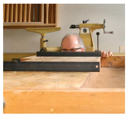
Twist detective. A pair of winding sticks allows you to see if the benchtop is twisted.