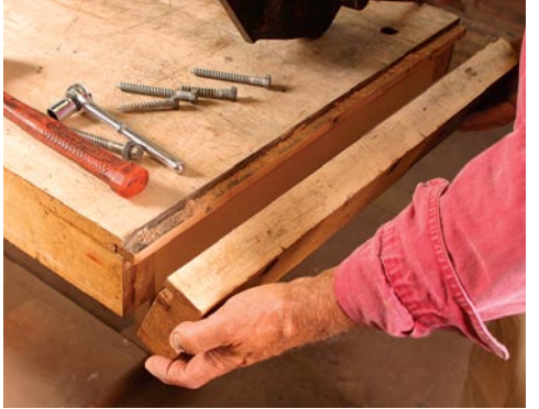
Remove the vises. You'll tune up the vises after the top has been flattened. If your bench has them, unbolt the stabilizing battens (above) and clean out any sawdust that has worked its way down between them and the benchtop.