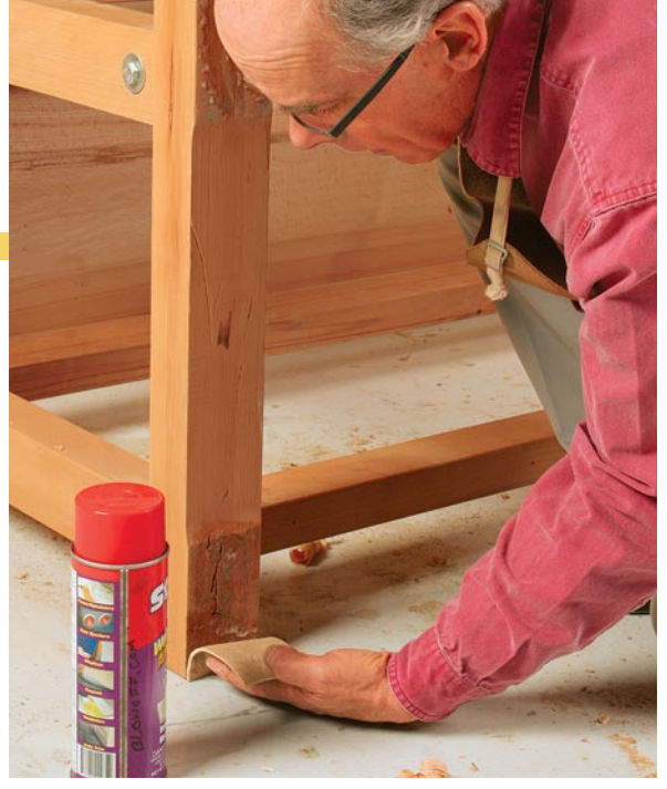
Nonskid pads. Thin pieces of rubber carpet underlay glued to the bottom of the feet prevent the bench from sliding around in use.

the epoxy to sink thoroughly into the affected areas. You also can add a little dye powder to help match the color of the filler to the bench.