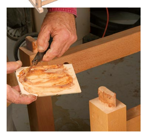
Reglue loose joints. Epoxy mixed with fine sawdust makes a good gap-filling glue if joints on the base have become loose.