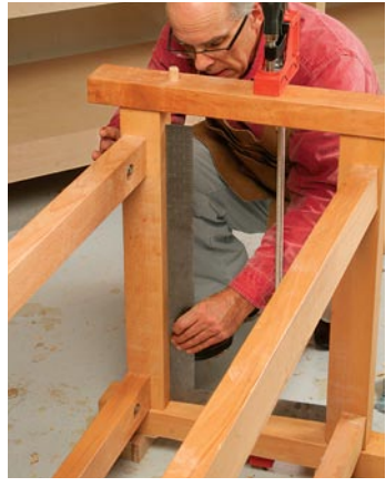
Check for square. When regluing and tightening the base, make sure the structure remains square.