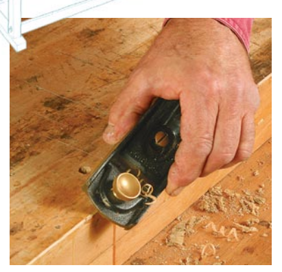
Bevel the edge. To prevent tearout when handplaning across the benchtop, use a block plane to create a small chamfer along the back edge.