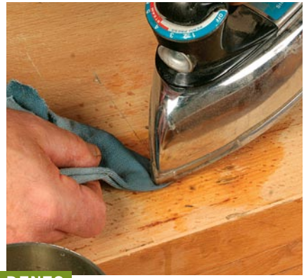
DENTS A swell repair. Minor dents can be repaired by applying a hot iron to the damp wood, causing the wood to swell.

Even with a flat surface, there will be gouges and holes too deep to be removed by planing. To patch deep gouges, I use a "Dutchman," which is a piece of wood slightly deeper, wider, and longer than the gouge and of the same species and appearance as the benchtop. Lay the Dutchman over the gouge with the grain aligned, then use a marking knife to scribe a line around it. Next use a router, laminate trim-