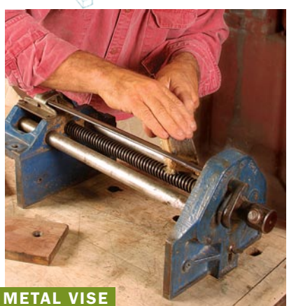
Clean and fresh. To prevent sticking, clean and lubricate the guide bars and the threaded rod (above). Attach fresh hardwood cheeks to the jaws (right).