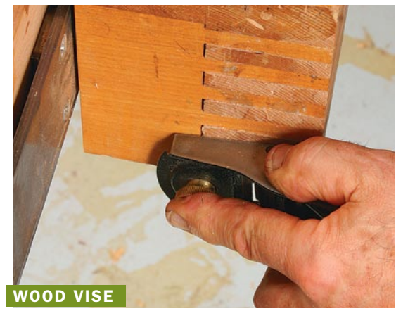
On the level. If joints have become proud (above), plane them smooth so that the two faces of the vise can meet seamlessly. Plane the top of the vise flush with that of the benchtop (right).