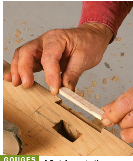
Lay a piece of wood (known as a "Dutchman") over a damaged section of the top and mark around it. Chisel out this section (left). Apply glue to two sides of the patch and insert it into the benchtop (above). The dovetail shape gives mechanical strength when patching an edge.