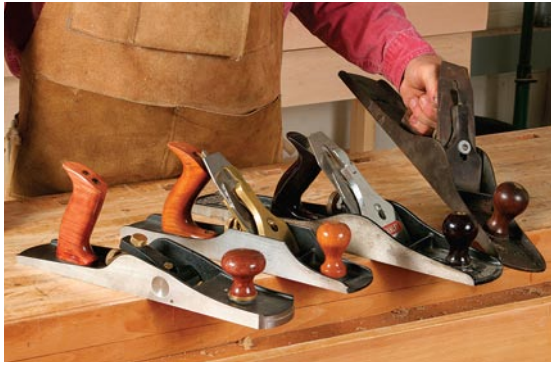
Pick a number. To flatten the benchtop, you can use (from left) a No. 5 plane (bevel up or bevel down), a No. 6, or a No. 7. The plane's length should nearly equal the width of the benchtop (excluding any tool tray).