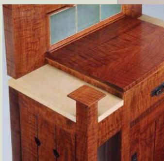
Capped for practicality. Storage compartments capped with Indiana limestone replace umbrella stands that appeared on the original.

The hall stand that inspired this piece featured umbrella stands flanking the central storage area. As delightfully English as that may have been, in the 21st-century