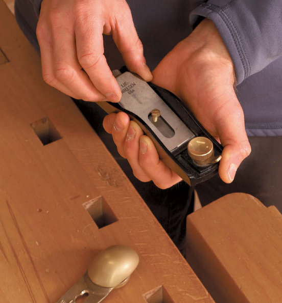
Swap out the iron. Korsak likes a freshly sharpened high-angle iron for end grain.