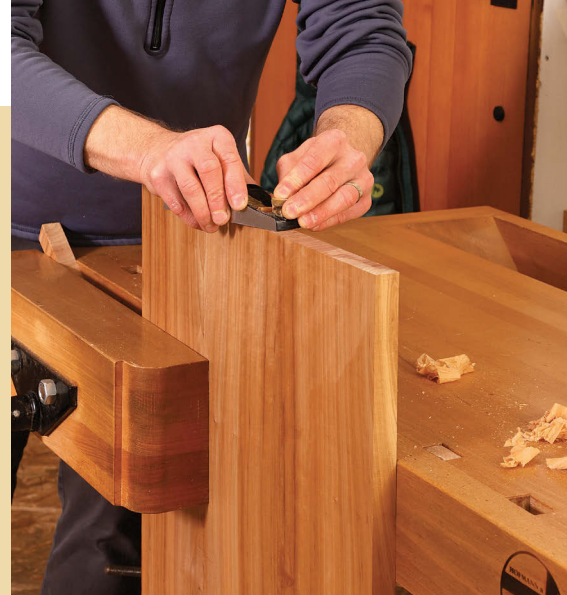
Use a vise for a wide board. When planing the end grain of wide boards like this one, Korsak fixes them in a vise.