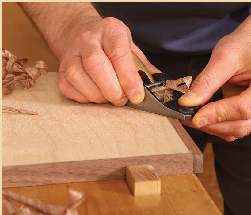
Flushing in two steps. Korsak uses two block planes to flush solid edging to a veneered panel. Here he takes a series of coarse shavings with the first block plane, stopping when the edging is about \frac{1}{64} in. proud of the panel.

One trick to using a block plane when flushing surfaces is to use a cambered iron (see Handwork, p. 28). With the iron slightly cambered, just the middle two thirds or so will project below the sole. This lets you more accurately control just where you're cutting; for example, when planing edging flush to adjacent veneer, you'll be sure that only the edging is being cut.