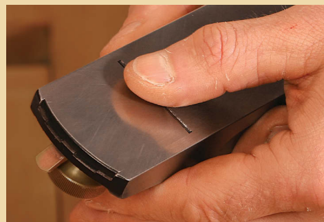
Final flushing. Using a second block plane, Korsak sets the cambered blade to take a very light cut (above) and finishes flushing the edging with several passes (left). The cambered blade lets him precisely focus the cut and avoid planing the adjacent veneer.