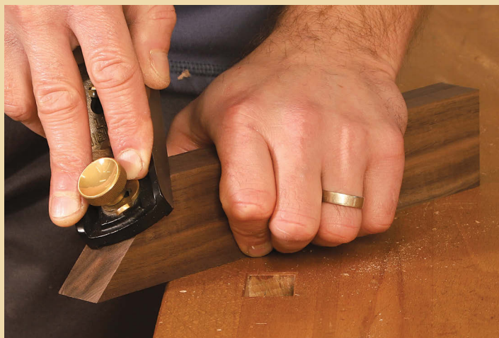
Fairing a miter. Rather than using a clamp to hold a mitered workpiece, Korsak holds it on edge with one hand and planes with the other. He does the same to plane end grain on most square-cut boards, steadying them on one edge with one hand while planing in a downstroke with the other.

I also tend to follow this approach for mitered parts. As long as the end of the stock provides enough surface area for the sole of the block plane to bear on without being tippy, I skip jigs and fixtures and just hold the work on my bench. If I'm planing very small parts, however, I'll use a bench hook to make steadying the work easier.