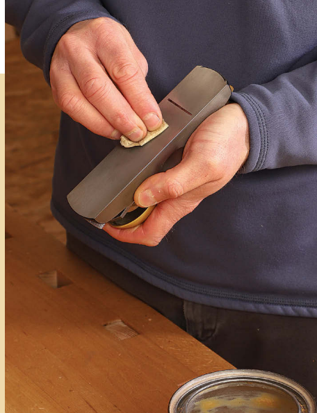
Wax up. Unless the surface he's smoothing will be glued (like some miters), Korsak waxes the sole of his block plane before planing end grain to minimize friction.