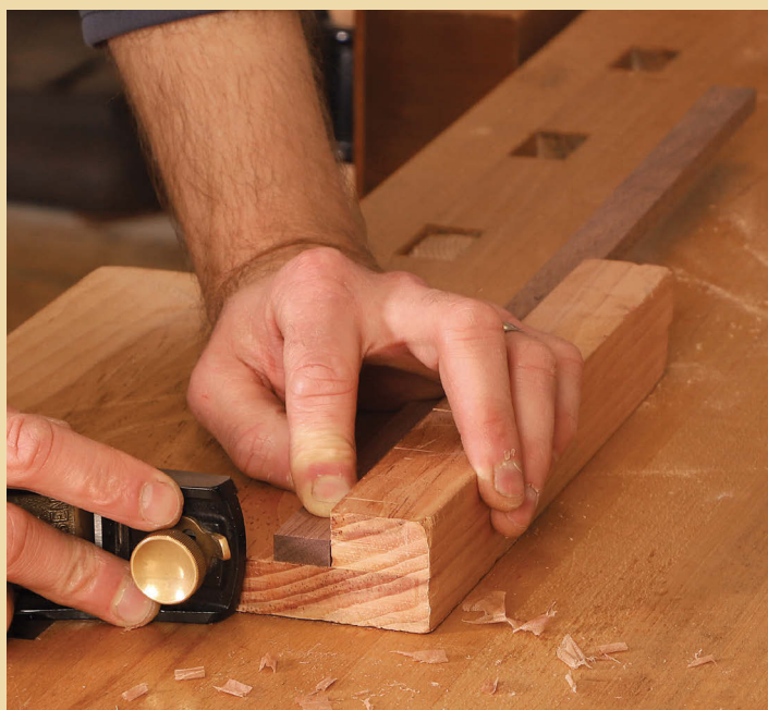
A hook helps with tiny parts. To smooth the end grain of very small workpieces, Korsak cradles the part in a bench hook and uses his block plane on its side.