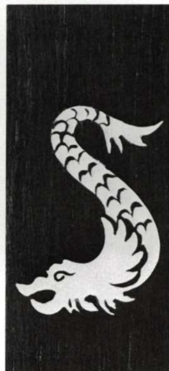
Very fragile and brittle, pearl must be sawn with a studied technique and special care. Left, with jeweler's saw and bird's mouth (the V-notched board clamped to his bench), Newman cuts a mythical sea beast from a mother-of-pearl chip. Top right, Dremel equipped with a tiny end mill routs the recess for the pearl inlay. It must fit easily, but with no gaps. Center, Newman uses an engraver's block to hold the stock when incising detail into the pearl. Engraver's blocks are necessary for good results, since engraving requires moving the work into the tool rather than the other way around, as is the case with carving wood. Engraved gouges filled with epoxy/aniline dye mixture delineate details and add depth to the finished dolphin (about twice actual size), right. Newman used black dye, but other colors would work as well.

a V-notch cut in one end) to his bench. With jeweler's saw in hand, handle up, teeth down, he proceeded to cut around the shape of the beast, using a #3 jeweler's blade (photo, above left). Sometimes moving the pearl into the blade and sometimes moving the blade into the pearl, his easy sawing rhythm kept the blade from binding, which, had it occurred, would have fractured the pearl. Rhythm, he told me, is especially important when sawing tight curves, because interrupting the up-and-down motion can snag the blade, chip the pearl and ruin the whole job.