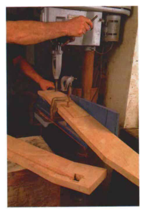
Using a hollow-chisel mortiser attachment on the drill press makes quick work of cutting the through-mortises in the chair's arms to take the leg tenons. The same device also works to cut the groove under the arm to fit on the side rails, as shown on the already-cut arm in the foreground.

Stickley used ammonia fuming to add color to his furniture. He discovered the method by noticing that oak stable stalls changed in color over time. He figured that the ammonia in horse manure reacted with the tannic acid in white oak to shade the wood pleasingly.