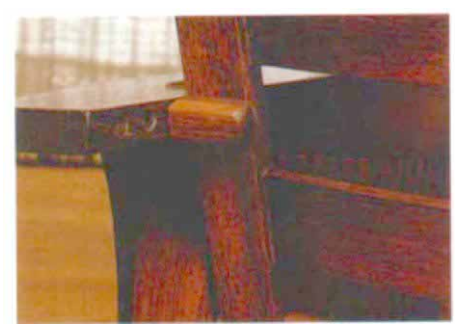
Back adjustment pegs (above) fit into holes in the arms. Moving the peg back allows the chair back to recline.

To glue up the back, I use the fixture shown in the top photo on p. 42 to hold the entire back unit square, flat and in po-