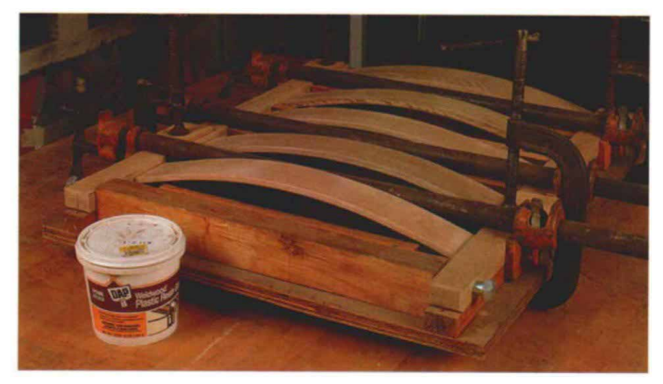
Back parts fit into a clamping fixture to keep everything straight during glue-up. Bolts through the back postpeg holes not only help align the parts in this fixture, but they are used to index the back posts in another fixture for cutting the slat mortises.

I sometimes fume sanded furniture parts before assembling them. If extra parts are made and fumed, they can be mixed and matched for best color before final glue assembly. The chemical reaction from fuming does not affect gluing, and parts marred during gluing can be touched up. Fuming smaller parts before assembly also allows more parts to be fumed in a concentrated space. As a last resort, regular