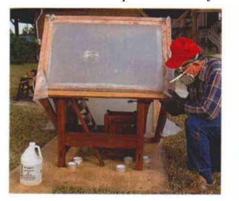
Using 26% ammonia to fume the wood gives distinctive color, but rubber gloves, protective eyewear and breathing apparatus are a must. Cups of ammonia are placed inside the plastic-sheet fuming tent with items to befumed and left overnight.