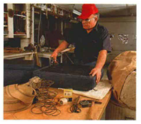
Stapling the bottom of a seat cushion, the author finishes the upholstery work for his Morris chair. Upholstery materials such as the cotton batting (right) or webbing and springs (foreground) are available from local upholstery supply stores.

wood stains may be used to touch up lighter spots. Stickley did that quite often.