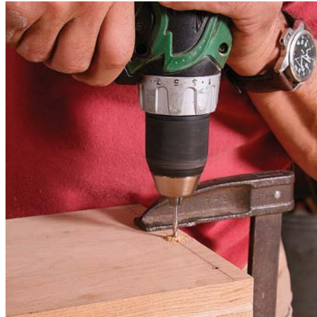
Pilot hole first. With the workpieces aligned and clamped, drill through the top board and into the bottom one with a bit sized to the root diameter of the screw.

To set screws flush or below the surface of the top board, drill a conical countersink (for flathead screws) or a flat-bottomed counterbore (for other screws).