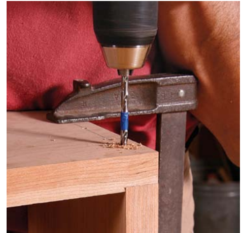
Clearance hole next. Drill into the pilot hole, using a bit just larger than the screw's thread diameter. A depth stop or gauge (in this case, tape) prevents drilling into the bottom board.