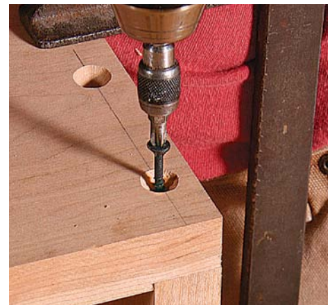
Then drive the screw. Accurate, tight, split-free screw joints result from proper predrilling.