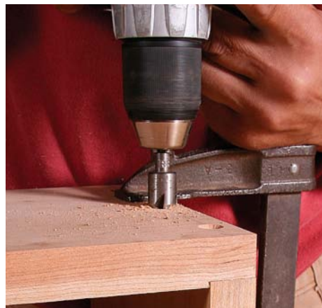
Countersink last. For flathead screws, use a countersink bit to cut a conical recess for the screw head.