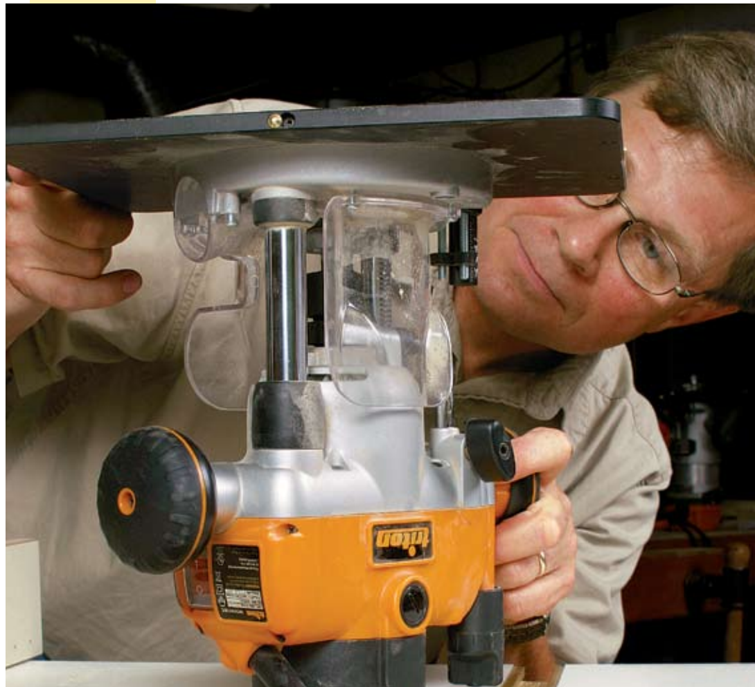
Dust collection. A plastic shroud around the Triton's base does a good job of directing dust to a shop-vac hose. None of the other routers has a good dust-collection design.