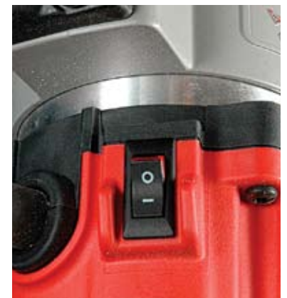
Switch styles. The Freud's large slide switch (left) is slightly easier to reach and use than a small rocker switch such as the one on the Milwaukee (above).