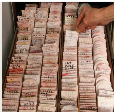
Family secrets. Samples of all the colors Lockwood has made are filed away along with the recipe of how each was formulated.