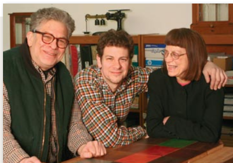
Pass it on. Two generations of the Schiffrin family operate W.D. Lockwood, supplying dyes to the woodworking industry.

When preparing your test board, you may find that surface tension prevents these dyes from adding color to the pores of