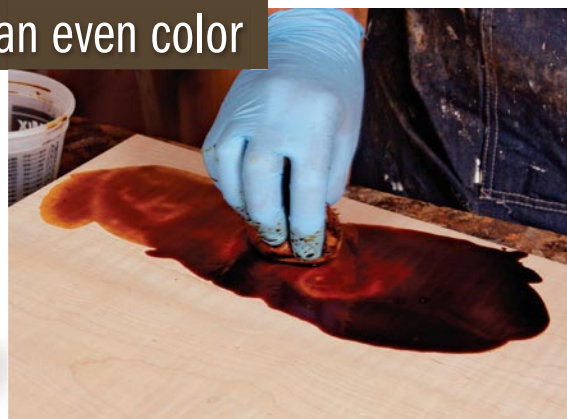
Flood the surface. Don't skim when applying the dye. You get better penetration if you wet the surface thoroughly.