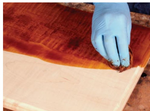
Uneven application? If you pause on a large surface, you can apply more dye as long as the surface is wet. At first the boundary will be obvious because the earlier dye had longer to penetrate.

woods like mahogany, oak, and walnut. To ease the surface tension, add a scant drop of dishwashing detergent to the dissolved dye. Don't add too much or you'll get a sudsy dye.