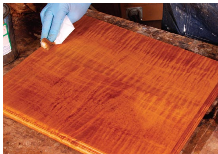
Uniform color. After a minute, the boundary will disappear and when the surplus dye is wiped away the surface will have an even color.

Dissolve the powder in denatured alcohol and stir the mixture occasionally for at least an hour. Once the powder is dissolved,