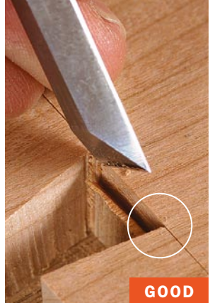
Why side bevels are important. If a chisel's side bevels terminate in large, flat sides, the chisel will not fit into tight corners (left). Chisels with very narrow, flat sides are ideal for getting into dovetails (right).