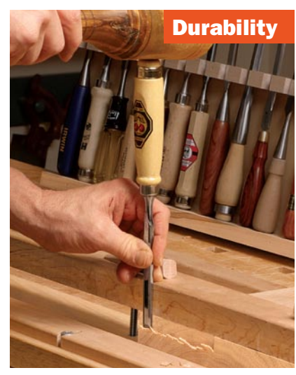
Chop till they drop. To test each chisel's edge retention, Gochnour used them to chop end grain on pine, cherry, and white oak.