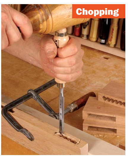
Cleaning up mortises. To see how well each chisel handled chopping, Gochnour used them to clean up a mortise in white oak.