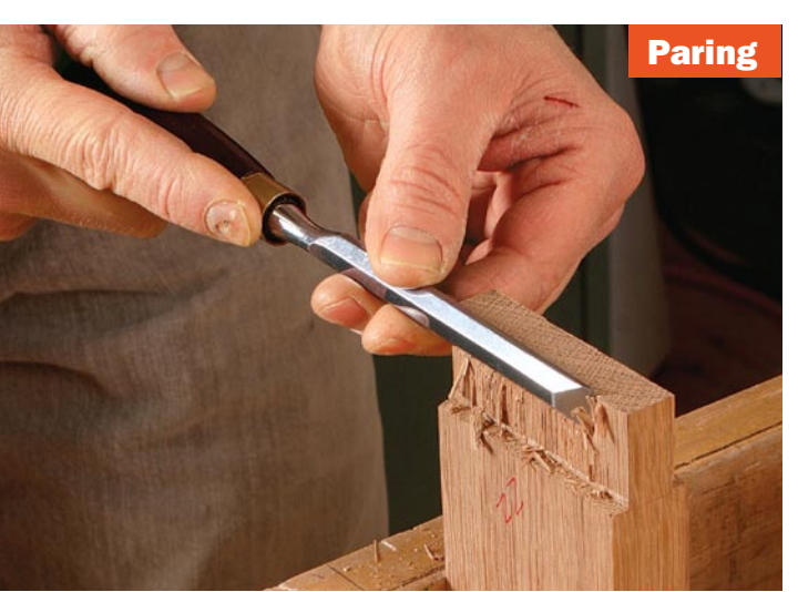
Long blades pare better. Chisels with short blades, such as Japanese-style ones, are not able to pare as wide a joint as the longer-bladed chisels. Plus, there is less blade to hold with the forward hand for fine control.

This chisel is a diamond in the rough. Its back was slightly concave along its length, but this lapped out without much trouble. The end of the handle must be mushroomed over to set the hoop in place, so plan on 30 minutes per chisel for this task. The finish on the handle was a bit rough, but fine sandpaper and steel wool polished it in a minute or two. In use, the tool performed admirably, its edge held up nicely, and at $14, it is a real bargain.