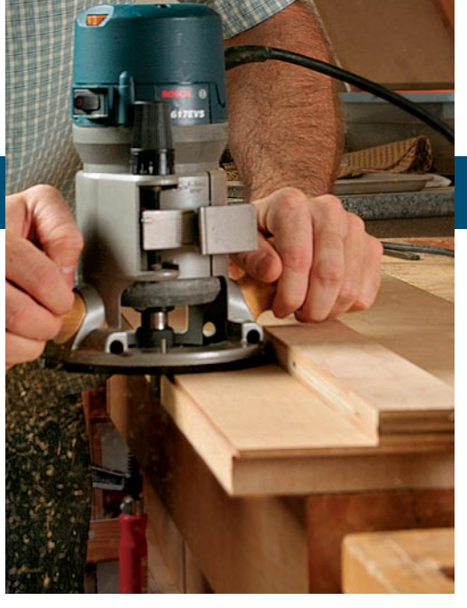
The guide keeps the router in line. Setup is easy, because the edge of the jig marks the edge of the cut.

with fixed shelves. The jig is a simple straightedge with a right-angle fence attached. Plowing through the right-angle crosspiece allows you to accurately align the fence with layout marks for each cut. Align the jig and clamp it to the work, with the fence snug against the edge of the workpiece.