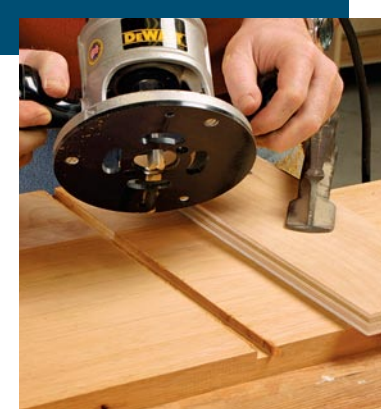
Making the cut. The router's base rides the edge of the jig. To ensure a straight cut, avoid rotating the base.

COPYRIGHT 2007 by The Taunton Press, Inc. Copying and distribution of this article is not permitted.