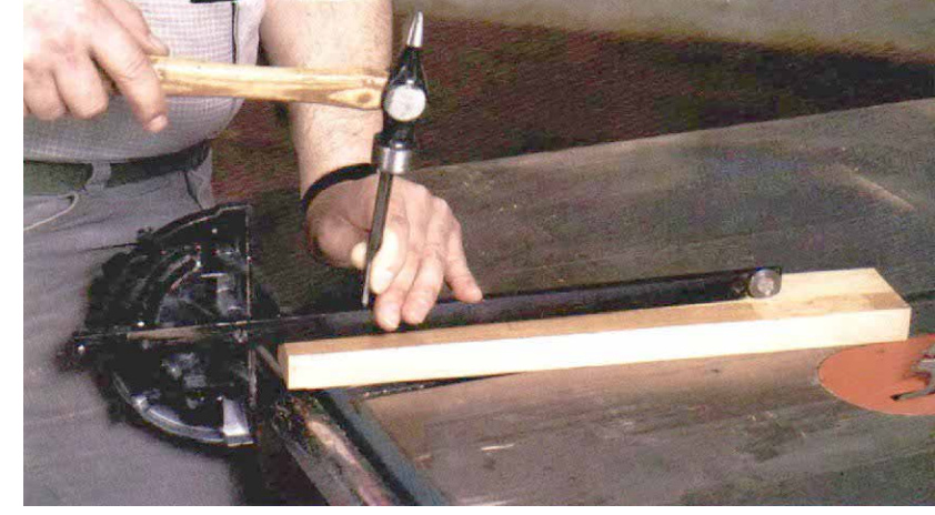
A snug fit between the miter gauge bar and the table slot is key to making accurate crosscuts on the tablesaw. Here, the author peens the bar, which causes the metal around each indentation to expand, and increases the width of the bar for a tighter fit in the slot.

Now that the blade is square, adjust the stop for 90°. On the Delta 10-in. Tilting Arbor Bench Saw, the tilt stops are screws that are accessible through the saw top. But on most saws, you'll have to reach up under the saw to loosen the locknut and screw the