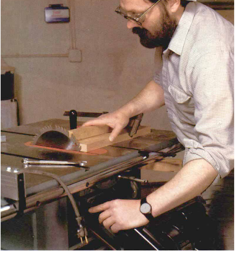
Parallelism of the sawblade with the saw table's miter slot is essential for smooth, accurate crosscuts. To test for parallelism, the author rotates the blade by pulling on the motor's V-belt, and he listens to the sound of the sawblade rubbing against a test piece, which is clamped to the miter gauge, to determine whether the slot is parallel to, closer to or farther from the slot at the back of the blade.

path the workplace travels during the cut. This means the miter slot has to be parallel to the blade. When the blade and slot aren't parallel, the sawblade is heeling and has a tendency to recut the workpiece at the back of the blade. This double cut is not only inaccurate, but also dangerous because the back of the blade can lift the binding workpiece and kick it back.