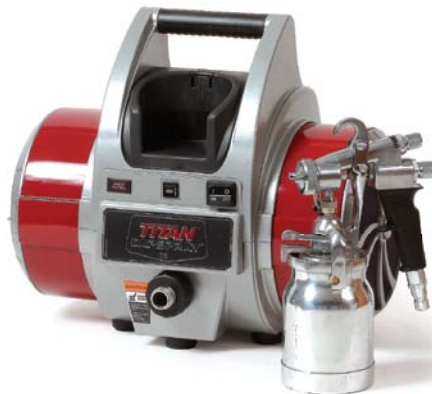
TITAN CAPSPRAY 75