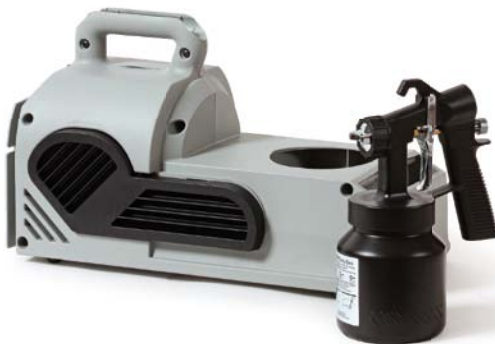
ROCKLER HVLP SPRAY SYSTEM

Poor pattern. A sloppy or pear-shaped spray pattern makes it almost impossible to blend overlapping strokes together.