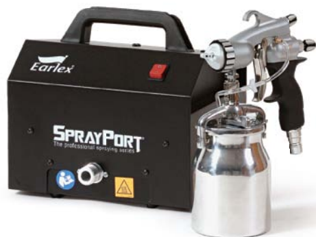
EARLEX SPRAYPORT HV 6003

Out of the way. The hose on the Fuji Spray Mini-Mite 3 attaches out of the way at the end of the handle, and has an easy-to-grip coupling that makes it a snap to attach.