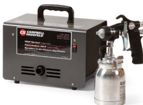
CAMPBELL HAUSFELD HV2500