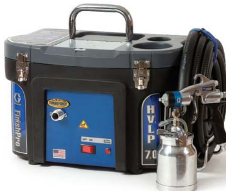
GRACO FINISHPRO 7.0