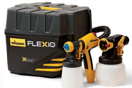
WAGNER FLEXIO 890