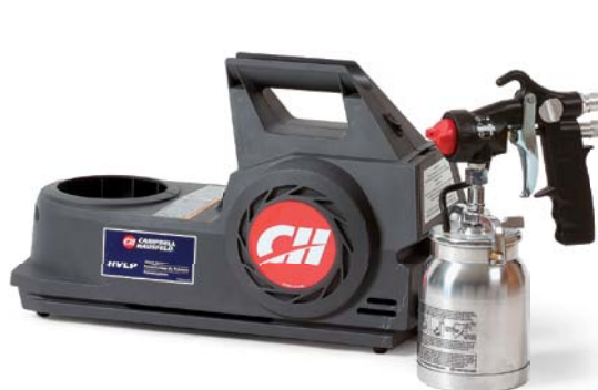
CAMPBELL HAUSFELD HV2002

To test the adjustability of each sprayer, I focused on ease of adjustment, intuitive design that doesn't leave you guessing at which knob to turn, smooth action, and convenient placement of the knobs that doesn't interfere with other gun features.