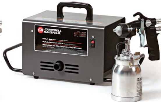
CAMPBELL HAUSFELD HV3000