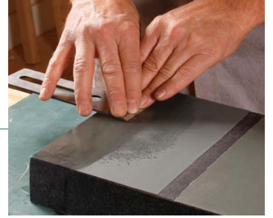
Or stick with the sandpaper. Extrafine grits of sandpaper can produce a polish just as well as sharpening stones. A second granite surface plate for polishing is nice, but not necessary.