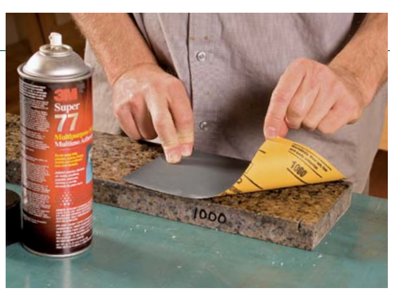
Easy on. Use spray glue, which is easy to apply and can be removed easily when it's time to replace the paper.

You need coarse grits to flatten a blade back efficiently, but coarse waterstones are soft and go out of flat very quickly. A better way is to use sandpaper, which cuts quickly, is cheap and easy to find, and when glued to a flat piece of granite, never goes out of flat.