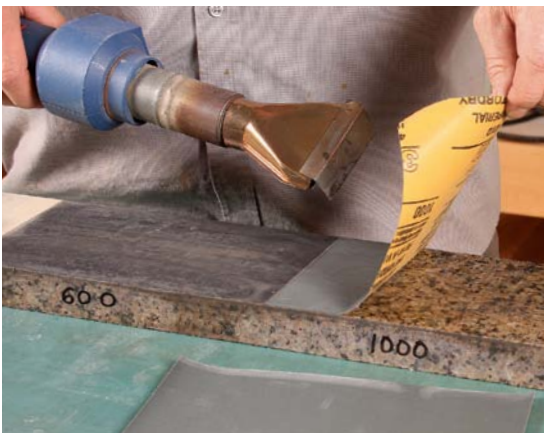
Easy off. To pull off the sandpaper cleanly, use a heat gun or hair dryer to soften the adhesive. Mineral spirits cleans up the leftover glue on the granite.