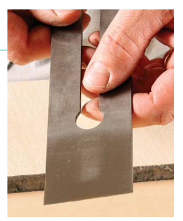
Start with 150 grit. Apply pressure with fingers from both hands within about \frac{1}{2} in. of the cutting edge (left) to ensure that the blade is flat on the sandpaper. Move the blade from side to side along the length of the paper, not in and out. Stay at this grit until there is a consistent scratch pattern extended back an inch or two from the cutting edge (above).

work, gluing a progression of grits to a piece of granite. Sandpaper is inexpensive and easy to find, and because the granite never goes out of flat, the sandpaper doesn't either.