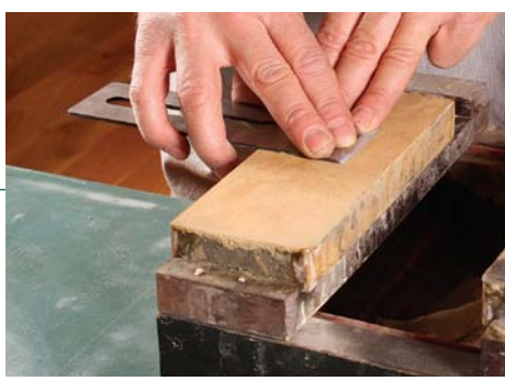
Use sharpening stones. Start with a medium grit, like 4000, and finish up with a polishing stone (8000-grit or higher). Make sure the stones are flat before you begin.

Chris Gochnour is a woodworker and hand-tool expert near Salt Lake City.