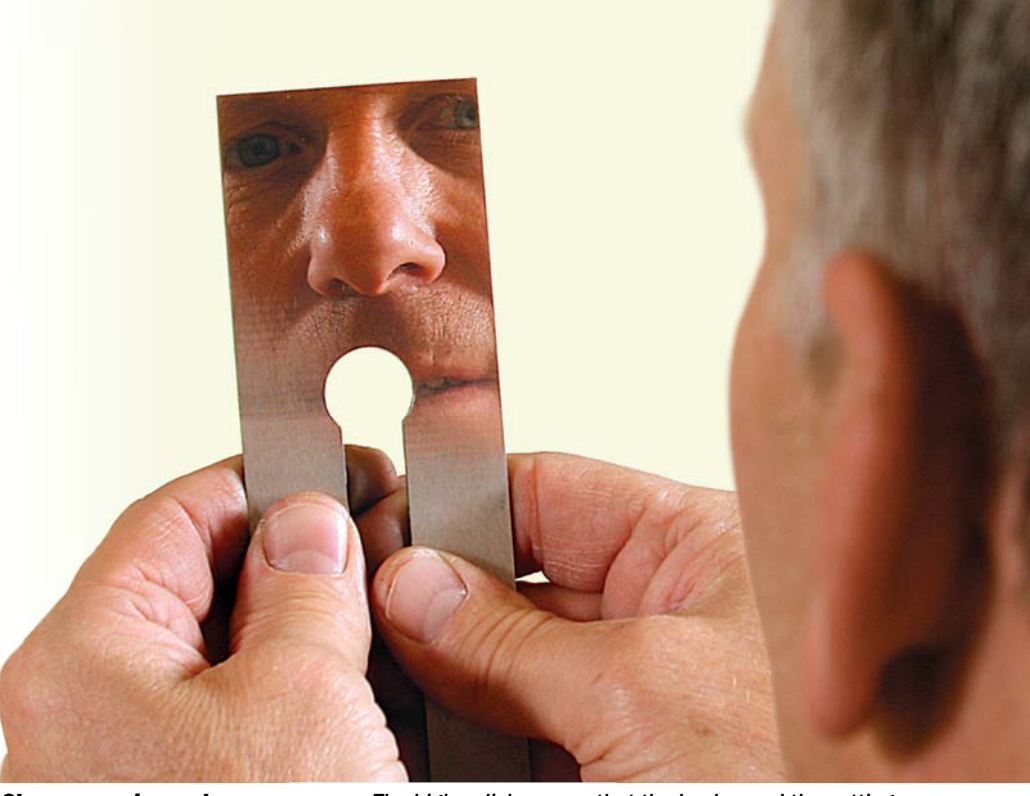
Clear as a mirror, sharp as a razor. The high polish means that the back—and the cutting edge—is truly flat and without blemishes. When it meets a bevel that's just as polished, the blade will be truly sharp.

Use aluminum oxide paper for the coarsest grits, 150 and 320. Then switch to wet-or-dry silicon-carbide paper (check automotive-supply stores). For the granite, use a surface plate (many woodworkingsupply retailers sell them), or an offcut from a stone fabrication shop (check the yellow pages).