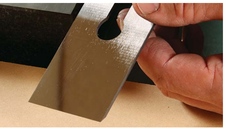
The payoff. The back is now ready for work, and you won't need to flatten it again. Removing the burr on the polishing stone (or 2000-grit paper) when you hone the blade is all the maintenance the back needs.