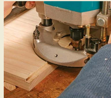
Mark and cut the rabbet. First, mark the rabbet location on the end of the shelf (left), then use a bearing-guided rabbeting bit to cut the rabbet (above).