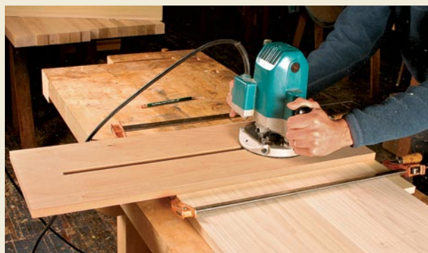
Rabbeted dado starts with a dado. A T-square jig helps cut a dado across the side. The slot in the jig is just wide enough to accept the bearing of a top-mounted bearing-guided straight bit.