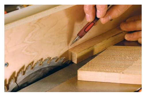
Start by marking the fence. Use a pencil line to indicate the front end of the blade. Align the featherboard so that it doesn't reach beyond this line, where it could pinch the blade.