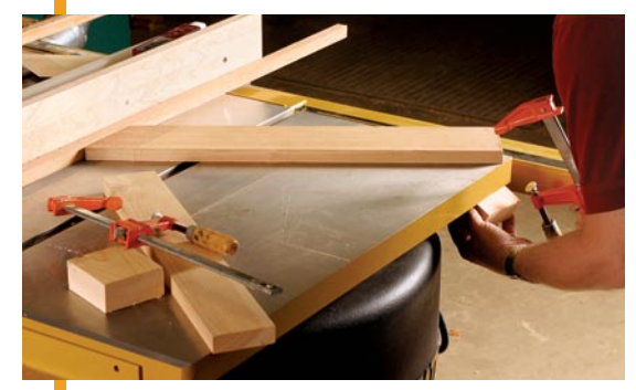
Clamp the featherboard in place. Lower the blade and place the stock between the fence and the featherboard. Snug the featherboard against the stock as you tighten the clamp.