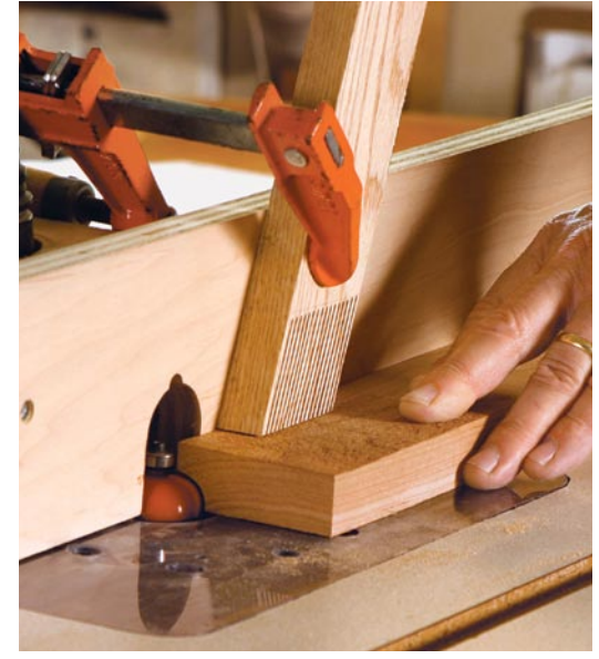
Fence-mounted featherboards apply pressure from the top down. This keeps stock firmly against the table for tasks like rabbeting an edge on the tablesaw (right) or cutting a molding profile or edge treatment on the router table (above).

The router table: If the stock is too narrow, wide, or short to work comfortably in short, if controlling the stock will put fingers close to the cutter—featherboards can make the setup safer. Of course, your best bet for safety and quality of cut is to make router cuts on wide boards, and then rip off the pieces you need. But sometimes narrow or thin stock is unavoidable.