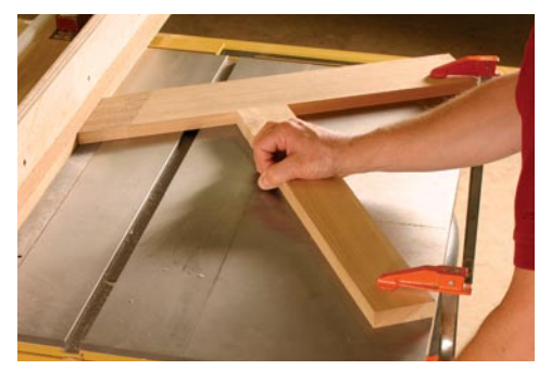
A brace keeps the featherboard from pivoting. Push this board snugly into position against the featherboard as you tighten the clamp.

essential featherboard setups on the machines where they are used most often.