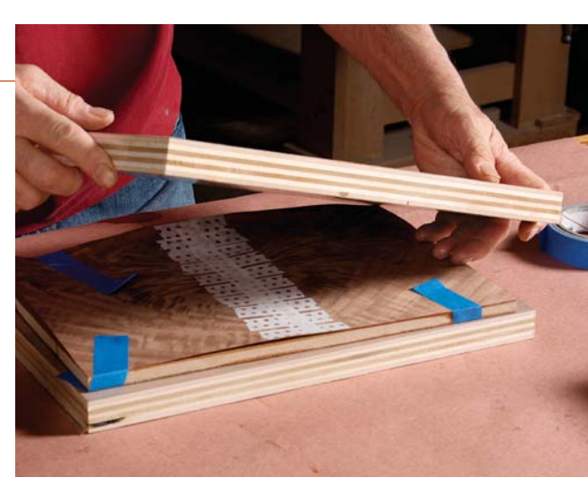
Roll out the brown carpet. Roll a healthy coating of liquid hide glue on the substrate for the panel (left). The coating has to be even and full to avoid dry spots. After both sides are loosely taped in place on the substrate, put the panel in the cauls for clamping (right).

a longer piece of veneer tape along the length of the joint to further reinforce the stitched pieces. When the veneer tape is dry, carefully remove the blue tape from the other side. To avoid pulling the veneer apart, pull up the blue tape diagonally, keeping the tape close to the surface. The veneer's now ready to be glued to the panel.