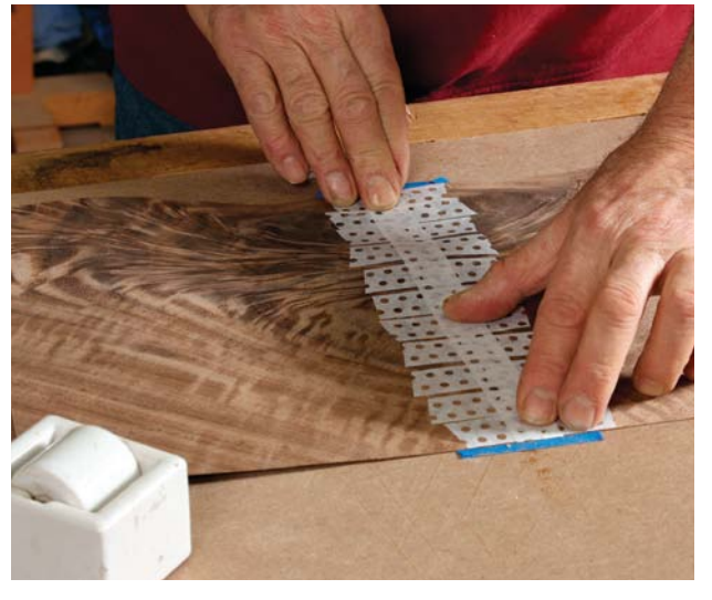
Flip it over for more tape. With the blue tape on, flip the sheet and apply veneer tape to the other side, stretching it over the seam horizontally. A final strip of veneer tape down the seam helps reinforce it even further. Once it's set, flip it back over and remove the blue tape.