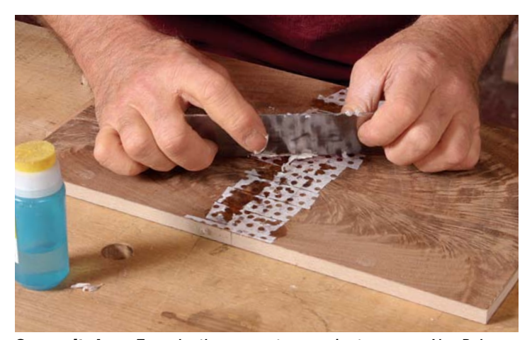
Scrape it clean. To make the veneer tape easier to remove, Van Dyke wets it with an envelope moistener and then uses a card scraper to gently scrape away the remnants.