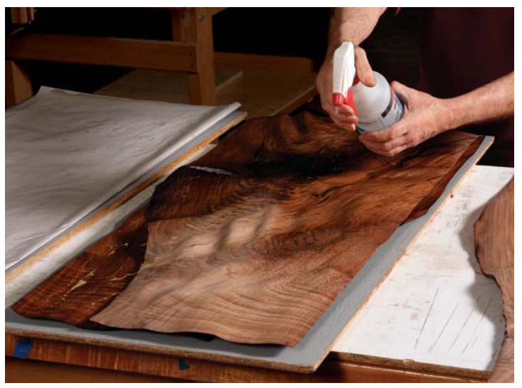
Hose them down. Apply a heavy coating of flattening solution across both faces of each sheet of veneer and stack them for pressing. Van Dyke places the consecutive sheets on the clamping platen with a few pieces of blank newsprint in between each sheet.