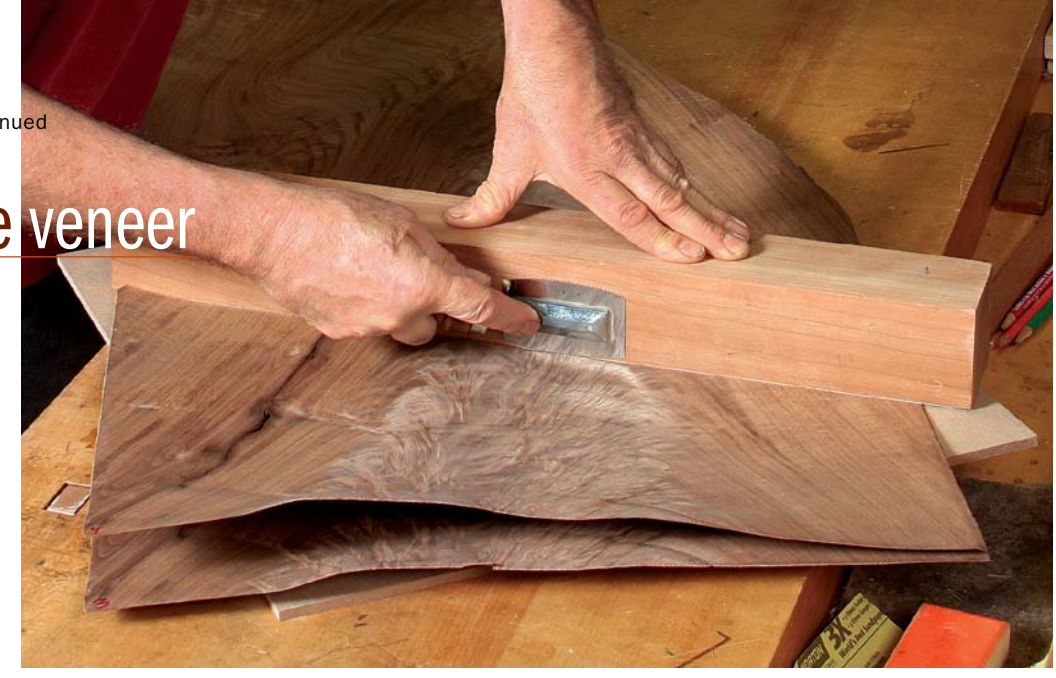
Rough out the veneer. With the two sheets for a book-match stacked and aligned, use a veneer saw and straightedge to rough out the pieces. The straightedge must be wide enough to register the veneer saw fully.

Now turn the taped sheet over and do the same on the show face using veneer tape. The veneer tape is activated by water and must be moistened before applying it. After the stitching, I usually put