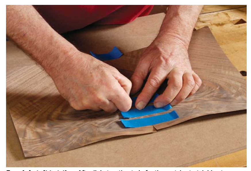
Tape brings it together. After lining up the grain for the match, stretch blue tape from one side to the other to bring the seam together tightly. Folding the ends of each strip makes removal much easier.