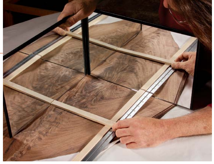
Mirrored view. Two pieces of mirror taped together help you visualize potential matches in the veneer. A couple strips of scrap pine can be used to section off the actual size of the panel, giving a better view of how the book-match will look.

Learn traditional veneering from Bob Van Dyke in a members-only video at FineWoodworking.com/extras.