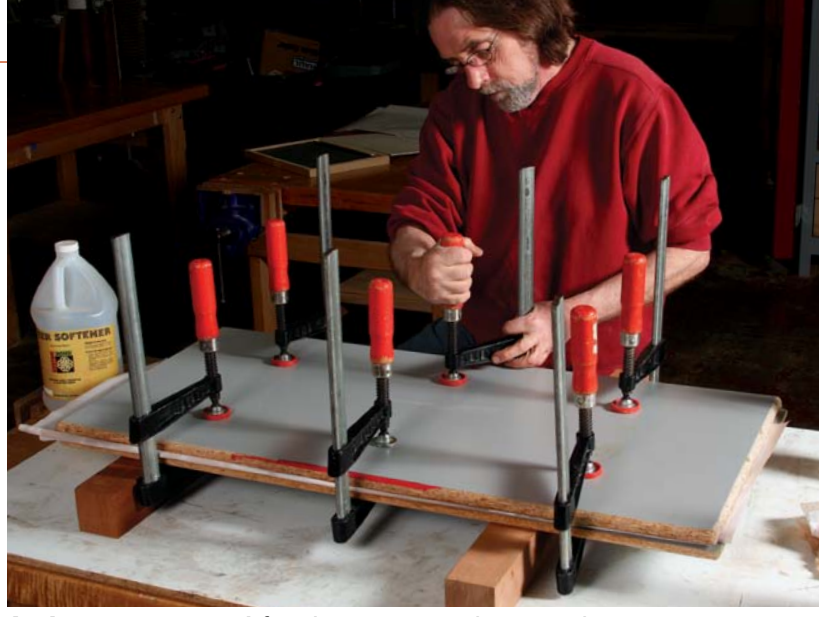
Apply some pressure. A few clamps are enough to tame the wavy veneer. Change the newspaper a few times a day over the course of two days, or until the veneer is no longer cold to the touch.