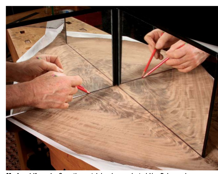
Mark out the cuts. Once the match has been selected, Van Dyke marks out the book-match seam and the edge perpendicular to the seam. A red pencil makes the marks stand out on the dark walnut veneer.

between them. Put the entire package between 3/4-in. melamine cauls, clamp it firmly, and let it sit.