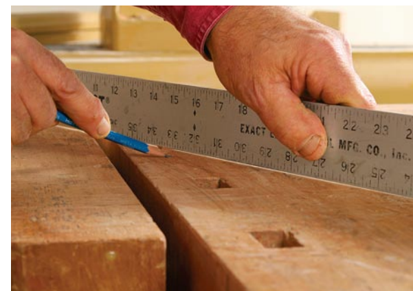
Flag the high spots. Move the edge of a 4-ft. ruler across the benchtop and use a pencil to mark the high areas.