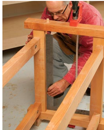
Check for square. When regluing and tightening the base, make sure the structure remains square.