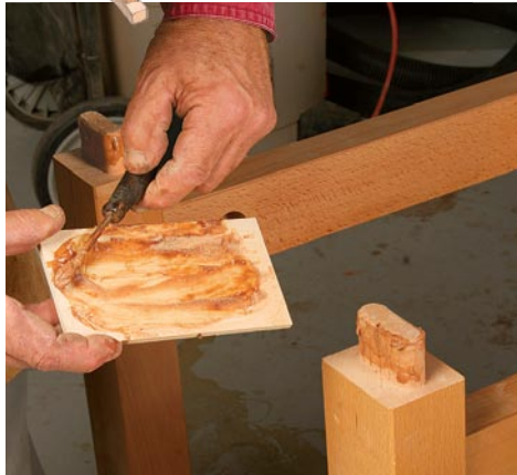
Reglue loose joints. Epoxy mixed with fine sawdust makes a good gap-filling glue if joints on the base have become loose.