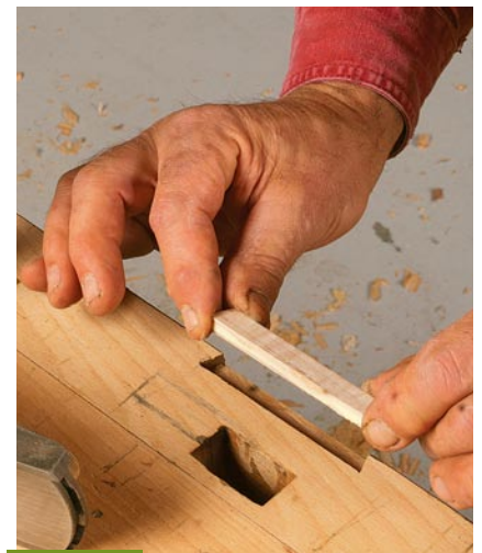
GOUGES A Dutchman to the rescue. Lay a piece of wood (known as a “Dutchman”) over a damaged section of the top and mark around it. Chisel out this section (left). Apply glue to two sides of the patch and insert it into the benchtop (above). The dovetail shape gives mechanical strength when patching an edge.