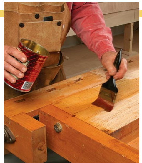
Seal with shellac. A couple of coats of thinned shellac seal the benchtop better than oil.