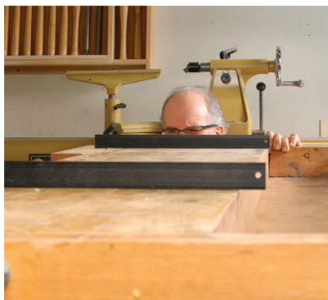
Twist detective. A pair of winding sticks allows you to see if the benchtop is twisted.