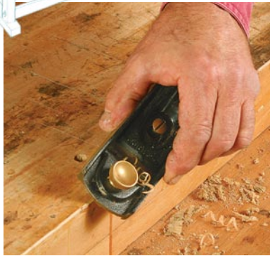
Bevel the edge. To prevent tearout when handplaning across the benchtop, use a block plane to create a small chamfer along the back edge.