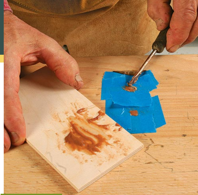
SMALL HOLES Epoxy does it. Medium-size holes can be filled with a mixture of very fine sawdust and epoxy. Frame each hole with masking tape.