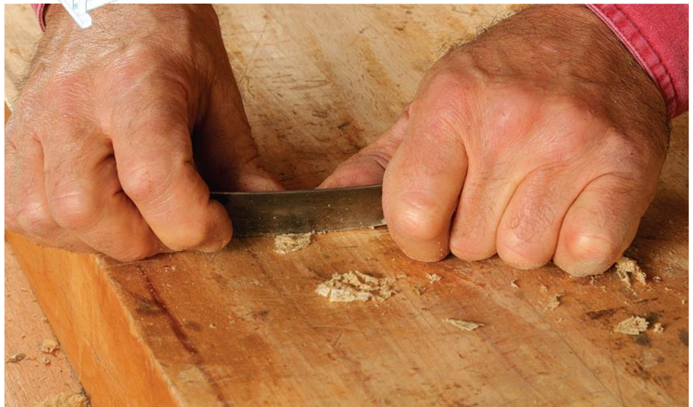
Smooth the bumps. Use a scraper to remove any dried glue or finish from the benchtop.

Early in my career, I used a belt sander to flatten my bench, but it only made matters worse. Handplaning is the way to go. You'll need a well-tuned No. 5, No. 6, or No. 7 plane, depending on the size of the workbench (see top right photo, p. 44). A high-quality plane from Lie-Nielsen or Veritas is a major investment, but you can buy a new Stanley or Anant for $60 to $90. It is also possible to find used planes on eBay or at flea markets, or you can borrow one from a fellow woodworker. (For tips on how to