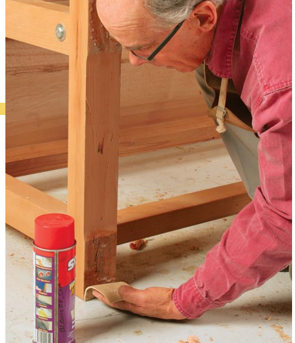
Nonskid pads. Thin pieces of rubber carpet underlay glued to the bottom of the feet prevent the bench from sliding around in use.

the epoxy to sink thoroughly into the affected areas. You also can add a little dye powder to help match the color of the filler to the bench.