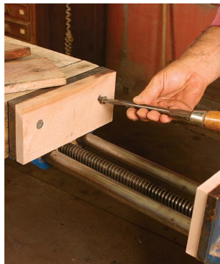
Clean and fresh. To prevent sticking, clean and lubricate the guide bars and the threaded rod (above). Attach fresh hardwood cheeks to the jaws (right).