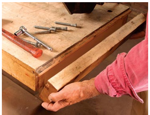
Remove the vises. You'll tune up the vises after the top has been flattened. If your bench has them, unbolt the stabilizing battens (above) and clean out any sawdust that has worked its way down between them and the benchtop.