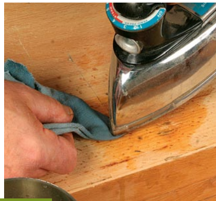
DENTS A swell repair. Minor dents can be repaired by applying a hot iron to the damp wood, causing the wood to swell.

Even with a flat surface, there will be gouges and holes too deep to be removed by planing. To patch deep gouges, I use a “Dutchman,” which is a piece of wood slightly deeper, wider, and longer than the gouge and of the same species and appearance as the benchtop. Lay the Dutchman over the gouge with the grain aligned, then use a marking knife to scribe a line around it. Next use a router, laminate trim-