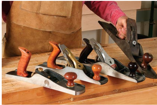
Pick a number. To flatten the benchtop, you can use (from left) a No. 5 plane (bevel up or bevel down), a No. 6, or a No. 7. The plane's length should nearly equal the width of the benchtop (excluding any tool tray).

tune up a plane, see “Handplane Tune-up,” by David Charlesworth, FWW #172). Planing the benchtop will be physically demanding and is not a task for those in poor shape. Traditionally, teenage apprentices were given the job on a cool day.