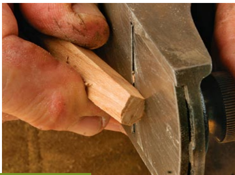
LARGE HOLES Square pegs in round holes. After cleaning up small holes with a Forstner bit, cut a peg slightly larger than the hole. Taper two opposite sides of the peg, round its corners (left), and tap it into the hole (center). When the glue has dried, trim the plug flush (right).