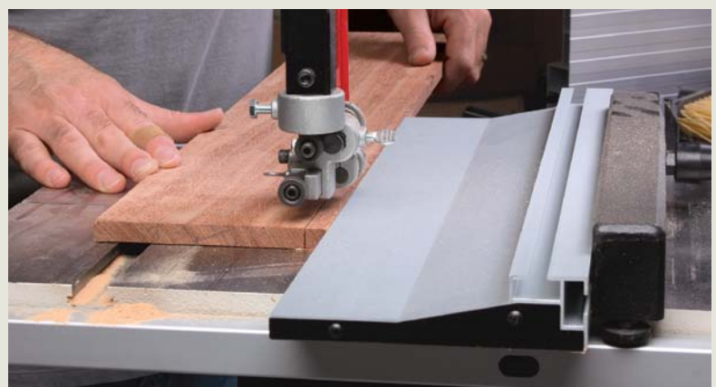
Two-position fences are safer. No matter how tall the workpiece is, you can always get the guide bearings close to it with this type of fence. The lower position also provides plenty of clearance for your hand or a push stick.

Johnson prefers the versatility and safety of two-position fences, especially when they can be adjusted without tools.