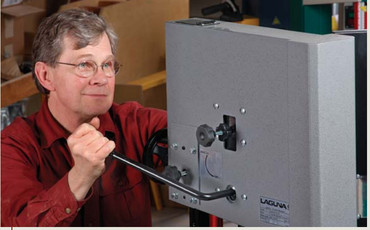
Quick-release tension speeds up blade changes. Most saws have a lever that releases or engages tension on the blade. Flip the lever and the tension releases instantly. Without it, blade changes take longer.

Unless your bandsaw is dedicated to a single type of cut, say for resawing, you'll need to change blades. It should be easy to install blades, and then to tension and track them.