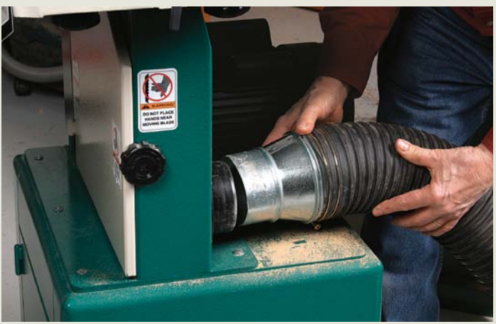
Lower ports miss too much dust. Falling dust is able to escape the port's reach. Both the Grizzly (shown) and Hammer saws have low ports.