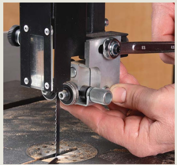
Tools slow you down. The guides on the Rikon 10-325 require two different wrenches (one box end, one Allen), making adjustments more cumbersome.