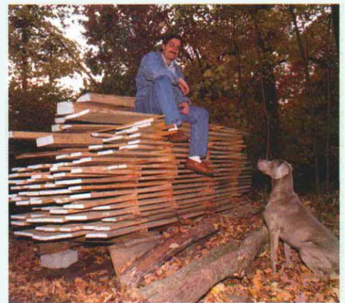
Homegrown lumber —The author harvested about 400 bd. ft. of white oak from a yard tree for about $1.50 a board foot.